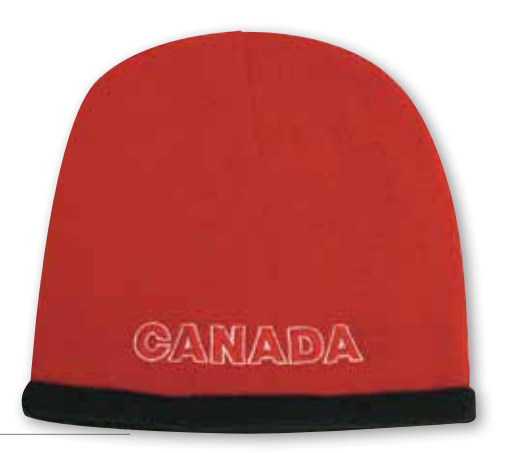
ROLL DOWN ACRYLIC & POLAR FLEECE BEANIE