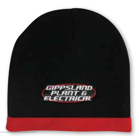
4188 ROLL DOWN TWO TONE ACRYLIC BEANIE