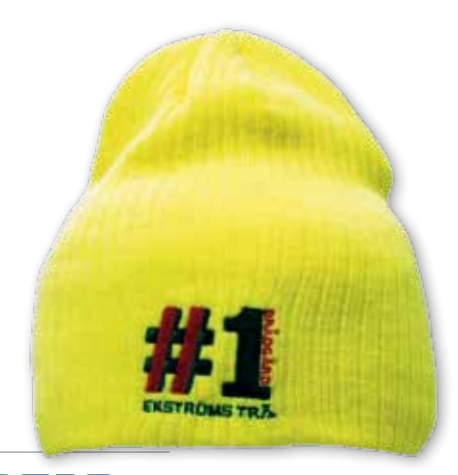
LUMINESCENT CABLE KNIT BEANIE