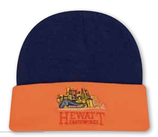
3027 LUMINESCENT SAFETY ACRYLIC BEANIE