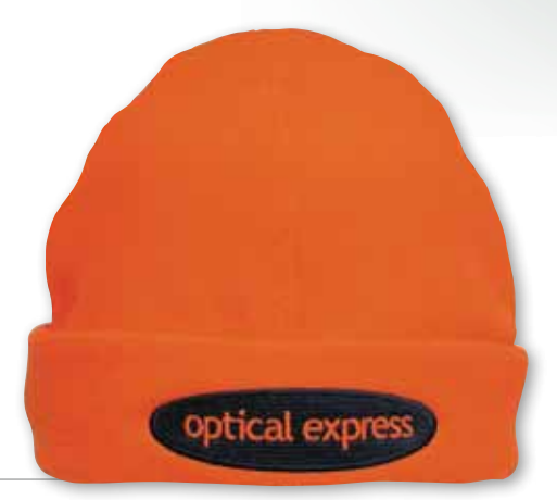
3025 LUMINESCENT SAFETY BEANIE