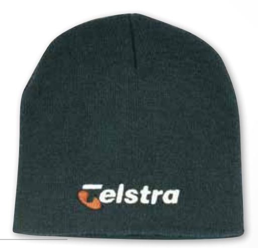
ROLLED DOWN ACRYLIC BEANIE