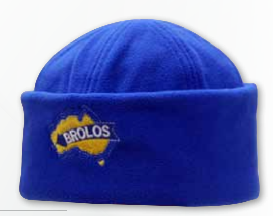
POLAR FLEECE BEANIE