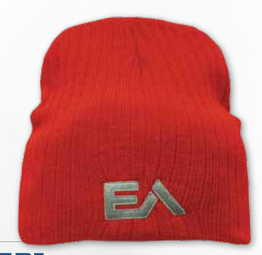
ROLL DOWN CABLE KNIT BEANIE