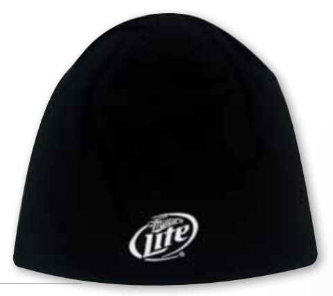
2757 ROLLED DOWN 100% COTTON BEANIE

DELIVERY MAY BY LONGER THAN STANDARD TIME DUE TO COMPLEX STYLE