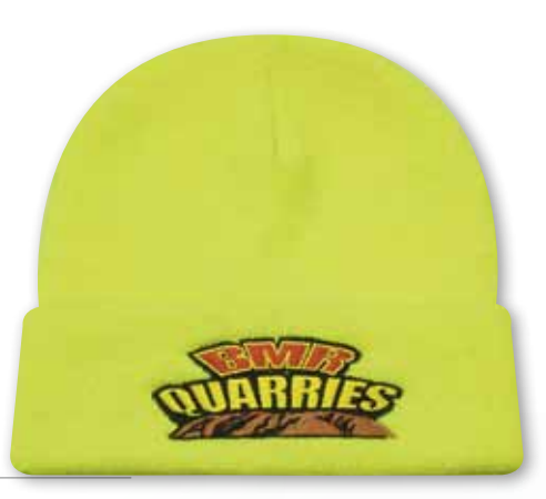
3028 LUMINESCENT SAFETY ACRYLIC BEANIE