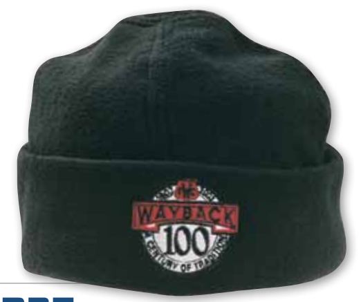
MICRO FLEECE BEANIE