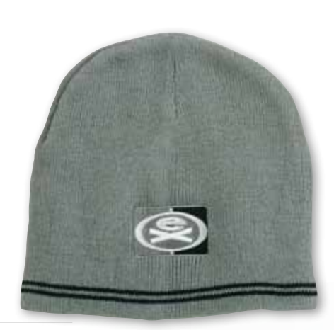
SKULL ACRYLIC BEANIE WITH STRIPES