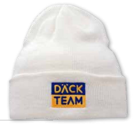
ACRYLIC BEANIE DEEP FIT